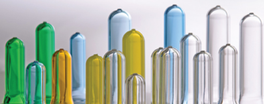
BLOW MOULDER Linear & Rotary