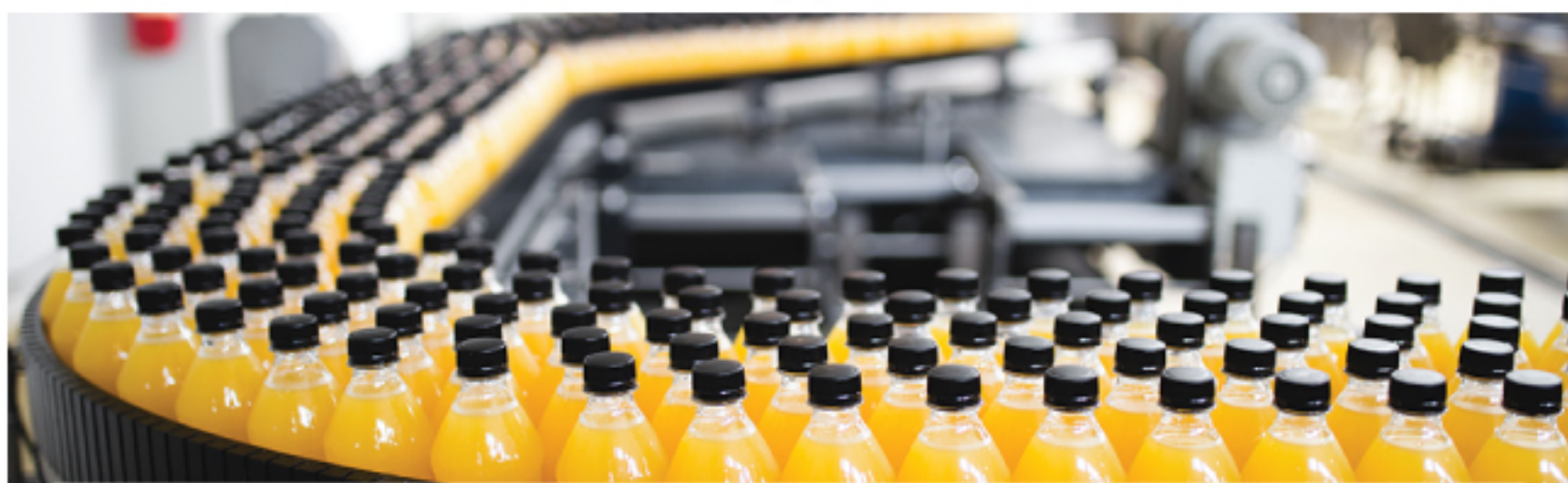
CONVEYORS PET Line/Glass Line/Can Line