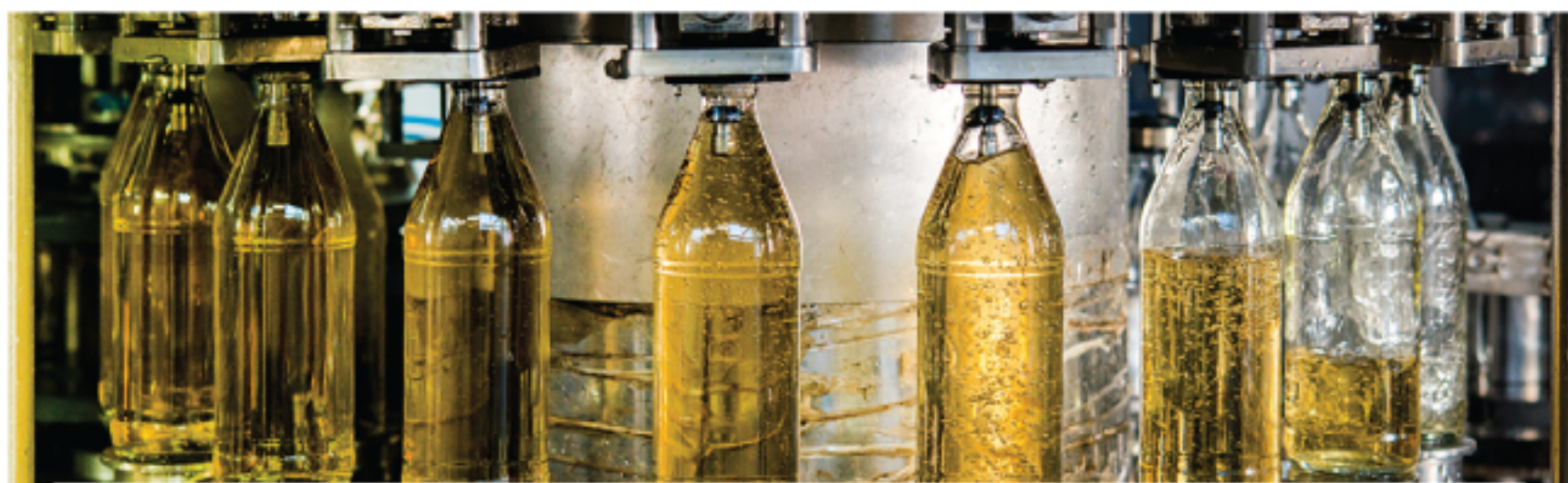
FILLERS Water/CSD/Beer/Alcohol/Hot Fill/Asceptic/Oil/Paint